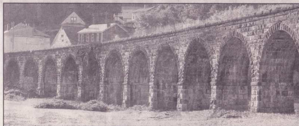
Great Stone Viaduct

Crafters interested in securing one of the limited spaces under the arches should